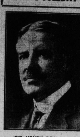
SIR HENRY DRAYTON

The Minister of Finance for Canada, Sir Henry Drayton, who is chairman of the Tariff Commission, will be in St. John next Tuesday.