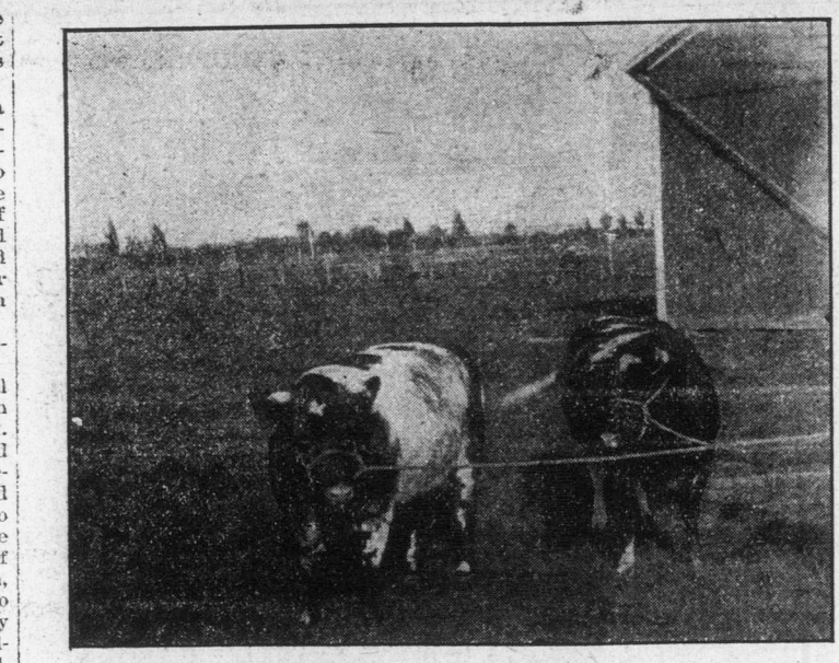
MILDRED AND MELROSE. Former Sweepstake Cow in Beef Class, 1901 and 1902.