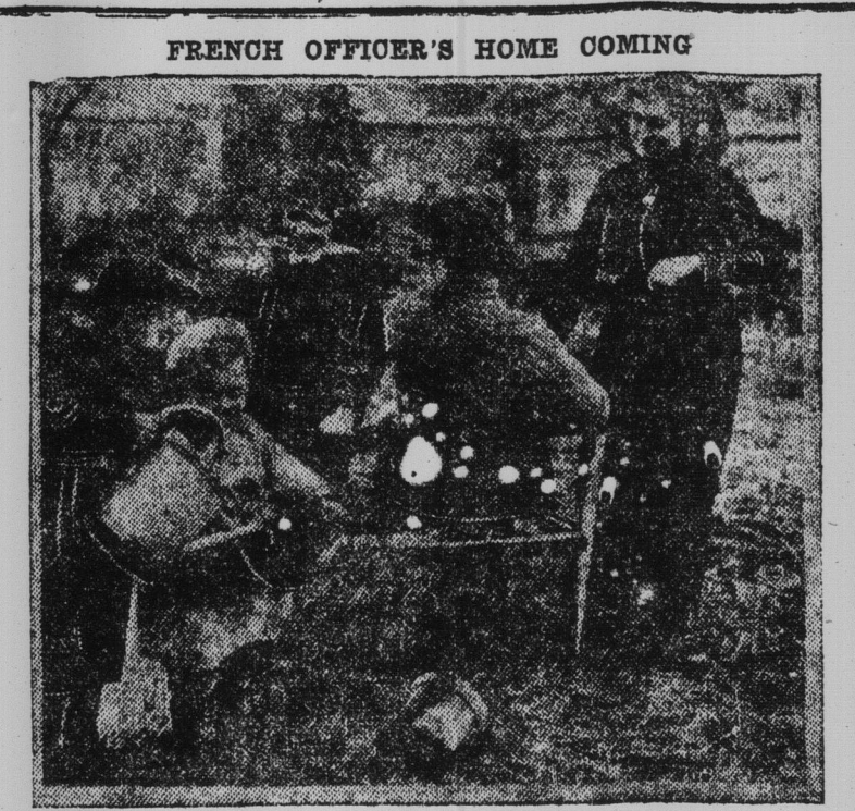
Arrival at home after long turn in the trenches. The children, who are doing patriotic gardening, find a novel use for the steel helmet,