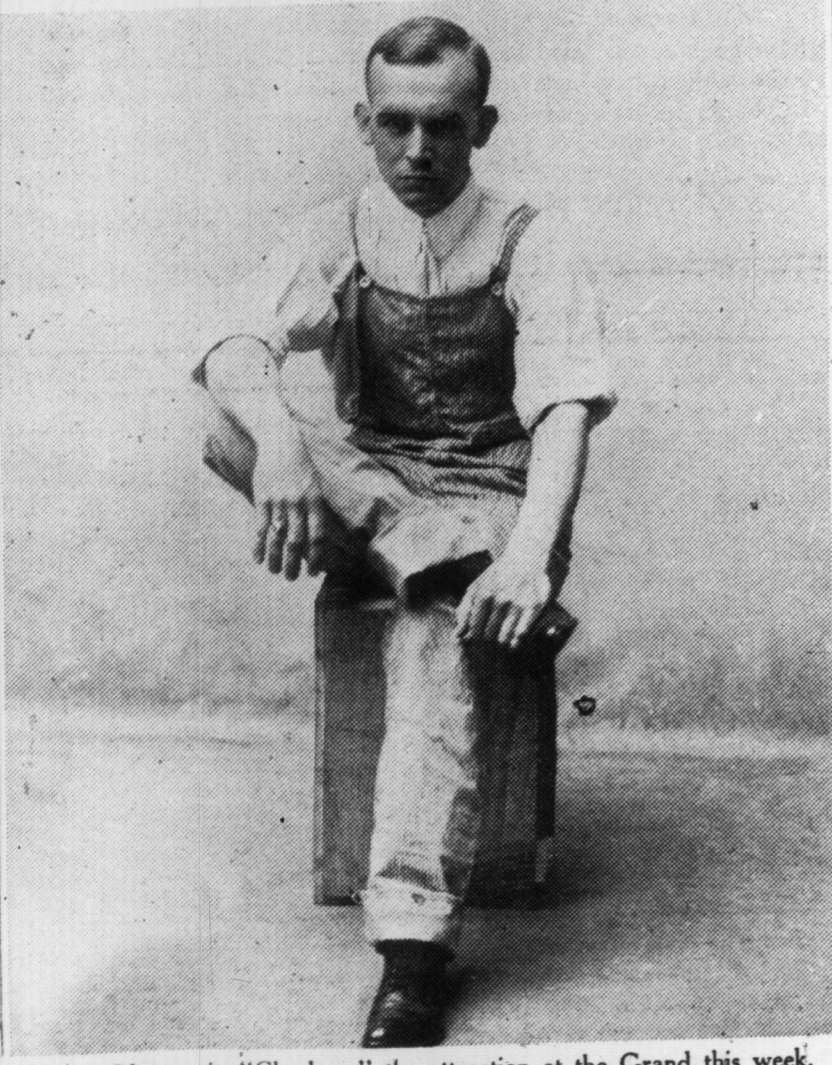
James Gleason in "Checkers," the attraction at the Grand this week.