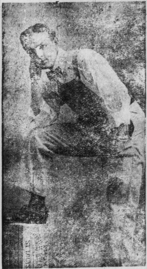
"GEE, AIN'T IT HELL TO BE POOR"