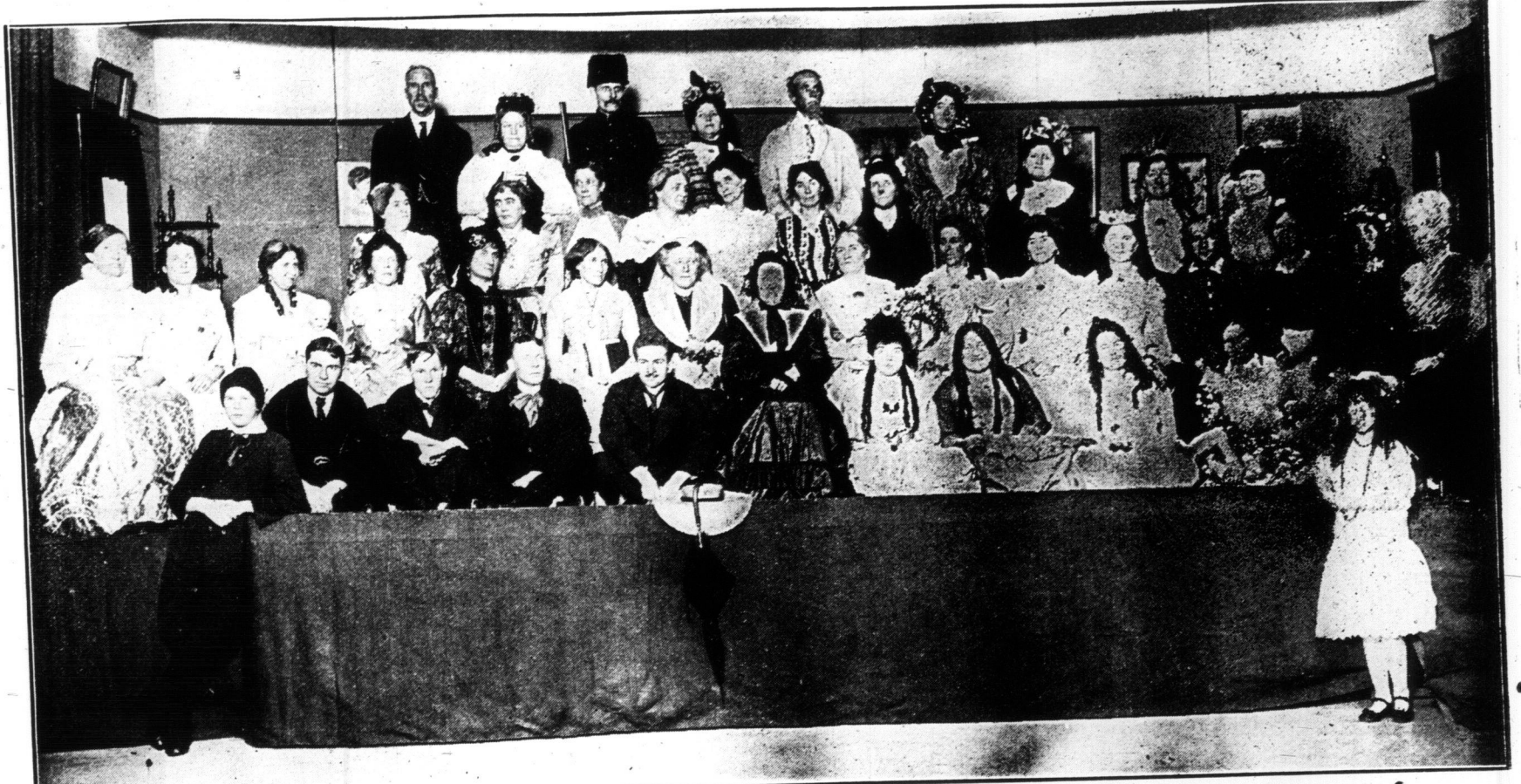
Church ladies present a play. Women of Chalmers Presbyterian Church, who presented "A Friendly Village Fifty Years Ago," under the church auspices, and afterwards repeated in the West End Y.M.C.A.