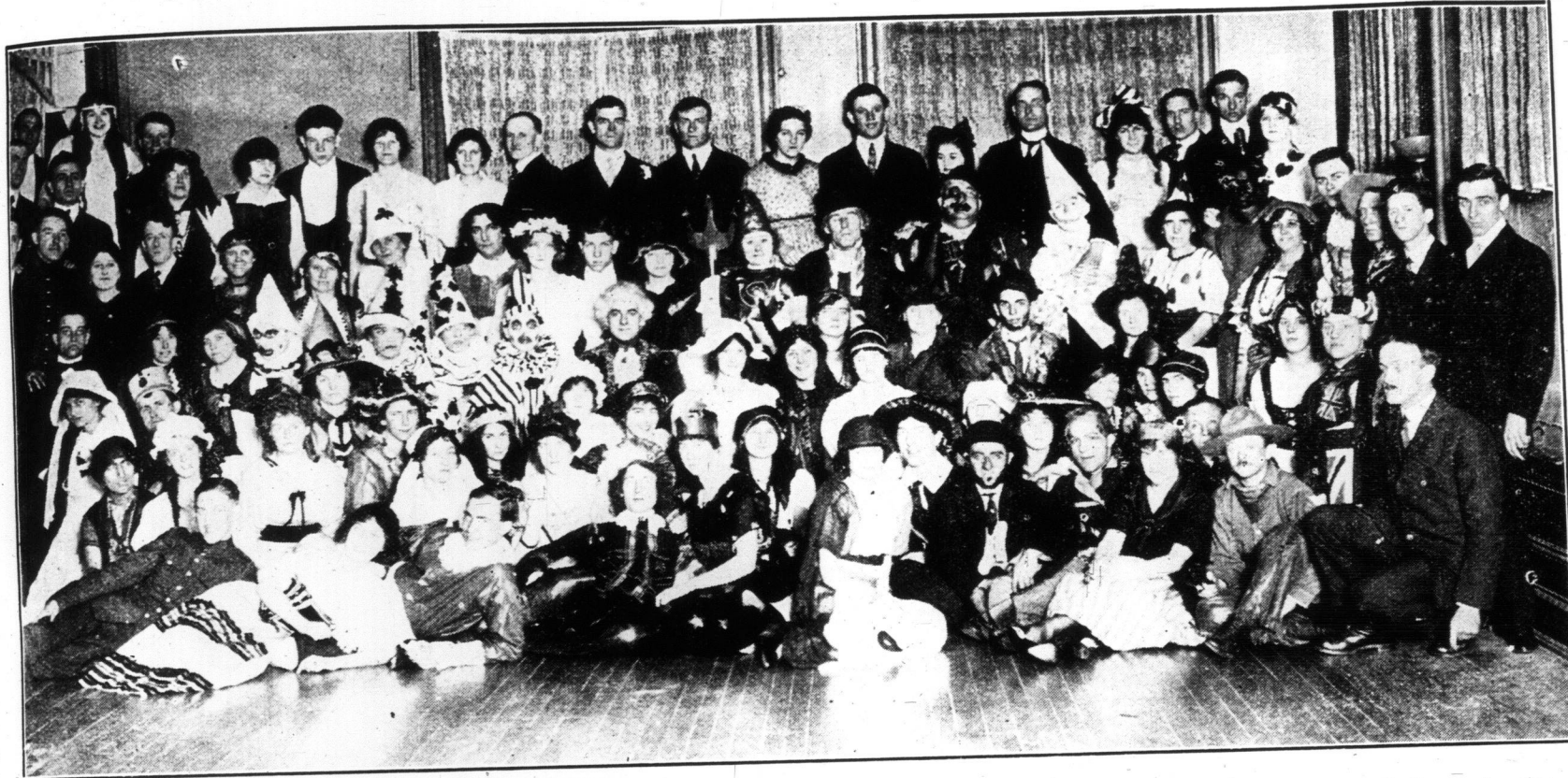
At the masquerade ball. Members of the Broadway Social Club make merry at their parlors, Brunswick and College streets.