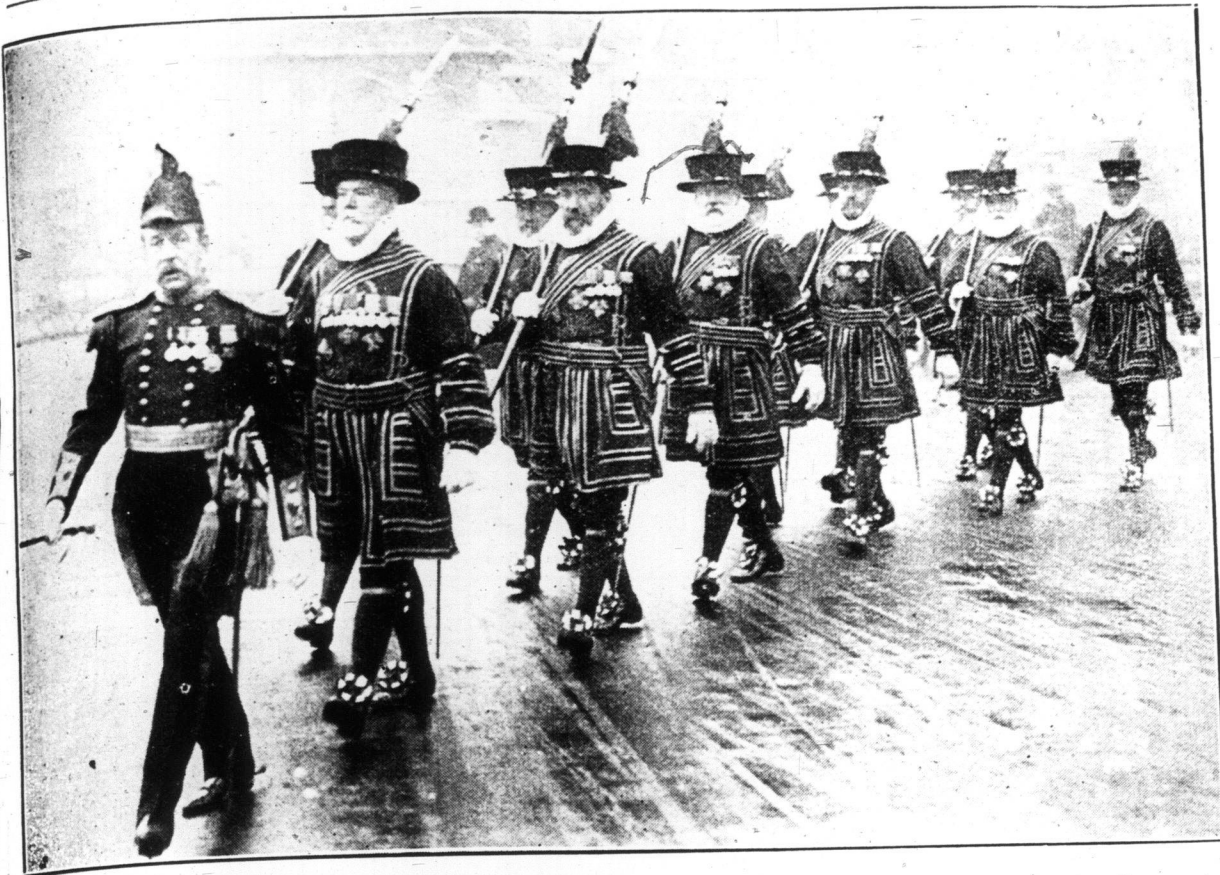
Making diligent search for possible Hun plots. Following the burning of the Parliament buildings in Ottawa, the historic Beefeaters, or yeoman of the guard, examined the vaults beneath the palace of Westminster to prevent the possibility of an enemy outrage in London.