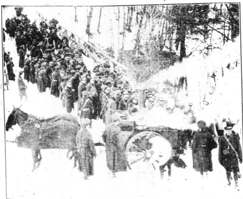
Attacking the field kitchen. Members of the 74th Battalion near the bridge on the old Belt Line during the sham battle a week ago.