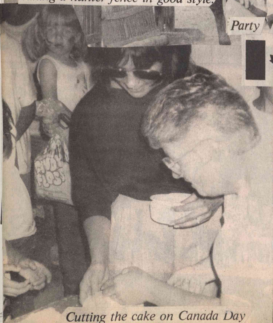
Cutting the cake on Canada Day