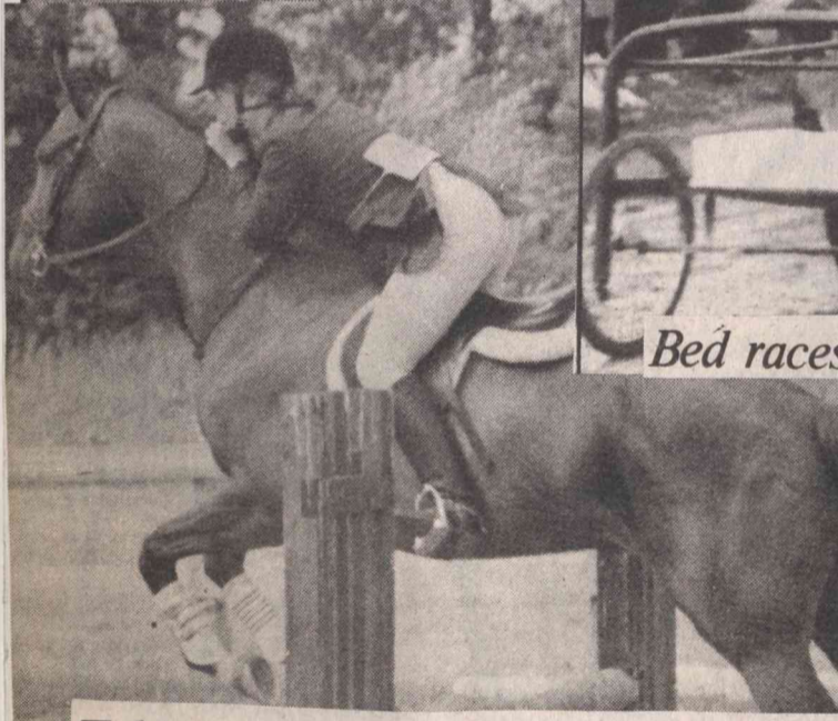
Taking a hunter fence in good style.