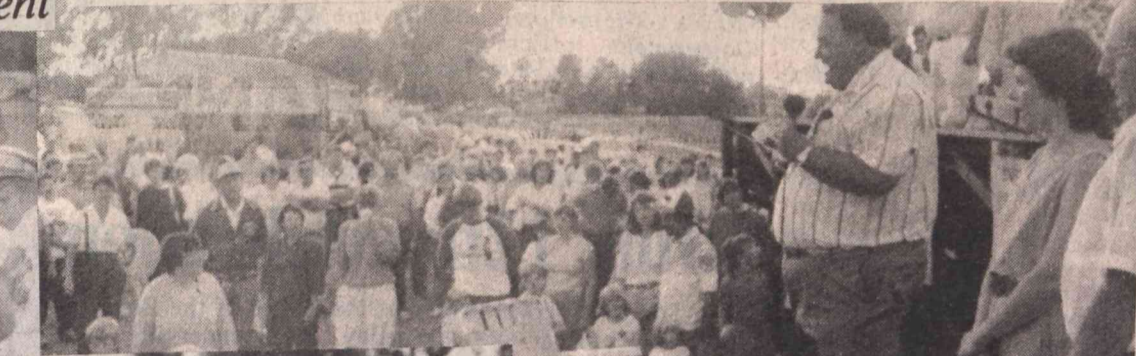
Singing O'Canada before the cake-cutting ceremony.