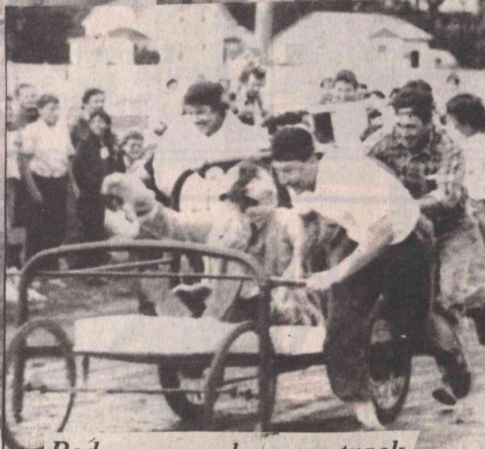
Bed races on harness track