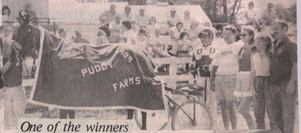
One of the winners