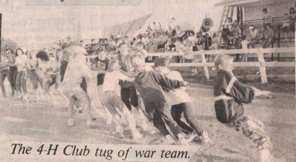
The 4-H Club tug of war team.