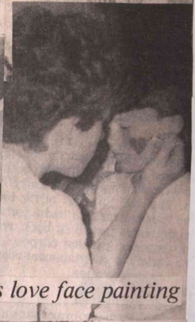
Kids love face painting