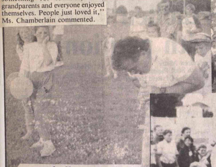
water balloon tossing.