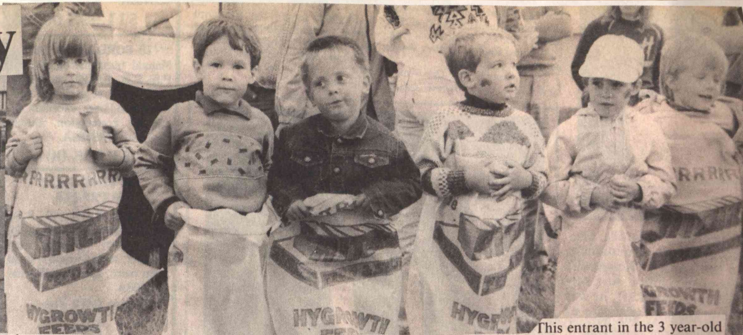
This entrant in the 3 year-old sack race seems a little perplexed with something. A number of events were held for the kids to occupy them before the evenings fireworks display