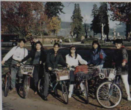
Weather was perfect for a cycle through Vancouver's Stanley Park.