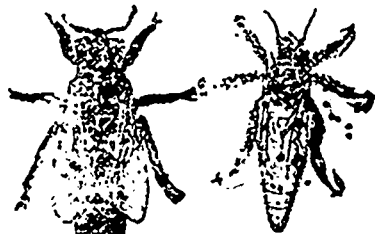
My Hives are the Cheapest and Best in use.

All those interested in Bees send for my 20 pag. circular and pamphlet on wintering bees (free).