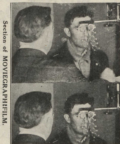
Section of MOVIEGRAPH FILM.

Here's a neglected part of our profession that can now add 50 per cent to the income of the average practitioner—no matter where located—without expensive equipment!