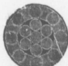
Locked Coil Aerial Cable or Coffery Guide.