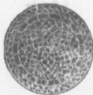
Locked Coil Winding Cable.

Manufacturers of all Kinds of WIRE ROPES for Mines, Tramways, Aerial Ropeways, Suspension Bridges, Cranes, Elevators, Transmission of Power, Steam Ploughing and General Engineering Purposes.