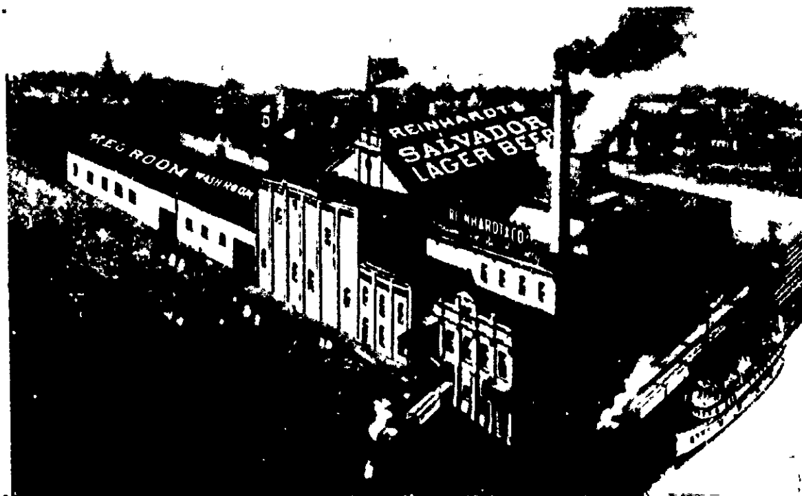
The Reinhardt Brewing Co's Premises, Toronto.

"As to moderate riding, any who were owners or trainers must know the usual formula for jockeys. Lie about third or fourth with your horse, pull him back, and wait if anything else goes along. You must do the same, but on no account overdo it. Another favorite instruction is: 'Get off well and pull your horse at the back of someone else's heels.' No doubt this style of riding caused numerous false starts in races. It was for that reason that Sloan was welcomed to this country. He taught English jockeys that they ought not to pull their horses about in races and waste their energies." Lord Durham hoped that English jockeys would pardon him for saying that he considered that exceedingly few of them had any tolerable idea of what pace meant, and they seemed to ignore the very elementary rule that the horse which could cover the allotted distance of ground in the shortest time would win the race. He considered that the reason of Sloan's success over English jockeys was that he was such a good judge of pace. He submitted that Sloan had been of immense value to English jockeys simply by teaching them that they had not been acting wisely in pulling their horses about as they had.