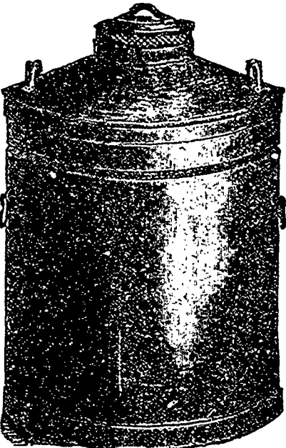
"EMPIRE STATE" MILK CAN.