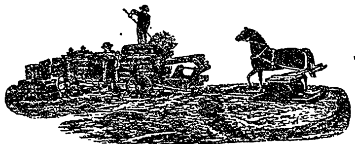
The only one on the market, which the horses can run without their work being bridled.

It affords us great pleasure to have it known that the improvements brought to our hay press "La Canadienne" have made it superior to all other horizontal presses working in the shape of half a circle. The fuller's course is 33 inches, that is from 6 to 9 inches longer than in any other horizontal press, which gives a wider opening to put the hay in and more speediness. Three men will do more work with our press "La Canadienne" than with any other press in the shape of a half circle, while it is much less tiresome for the horses. The materials employed are of the first quality, with the exception of two pieces of chilled cast iron, all the other parts are steel and malleable cast iron.