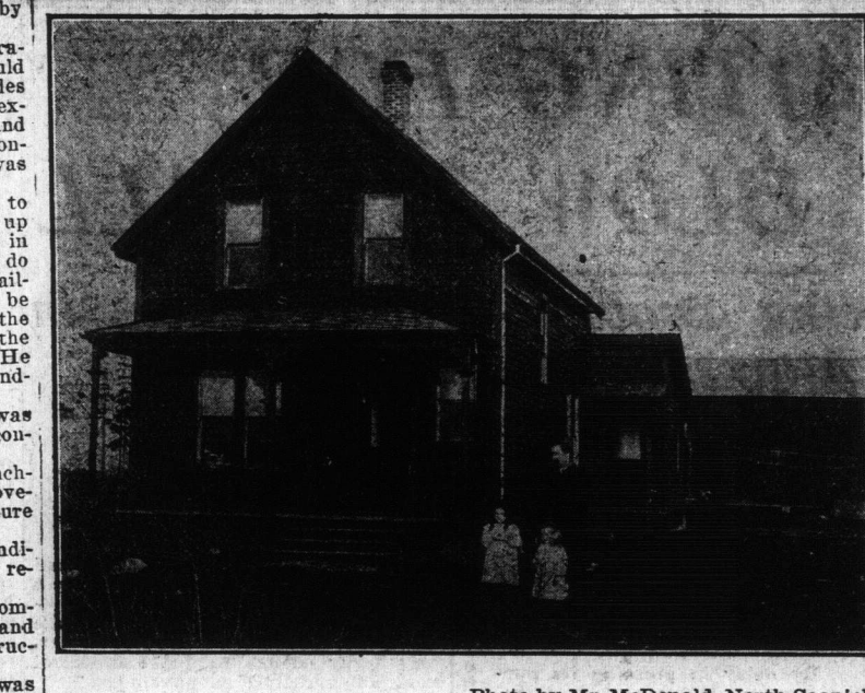
NEW METHODIST PAR SONAGE AT SIDNEY.