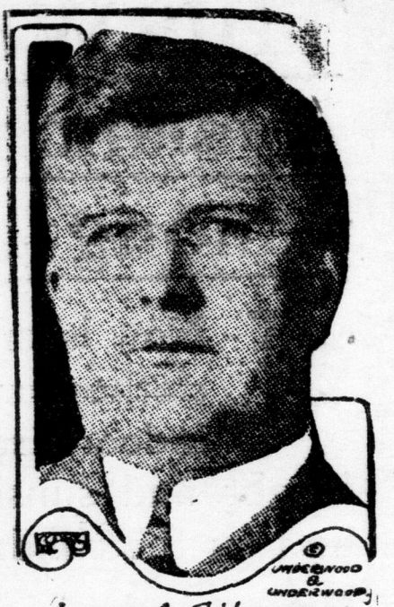
JAMES A. GILMORE, president of the Federal League, who has offered Christy Mathewson his own terms to manage the Brooklyn Federal League club.

Reulbach—Now with Brooklyn. Brown—Now managing St. Louis Federals. Overall—At home in California. Priest—Retired. Lundgren—Retired. Moran—Coaching the Philadelphia Nationals. Chance—Managing the New York Highlanders. Evers—Traded to Boston. Steinfeldt—Retired. Tinker—Managing Chicago Federals. Sheppard—Cleveland American Association manager. Slagle—Retired. Hofman—St. Louis Nationals or St. Louis Federals. Schulte—The last of the Mohl-Cubs.