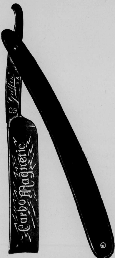
For three new subscribers you receive this Carbo-Magnetic Razor. Costs $2.50 in the ordinary way.

WE WANT THOUSANDS OF NEW SUBSCRIBERS TO THE FARMER'S ADVOCATE and HOME JOURNAL