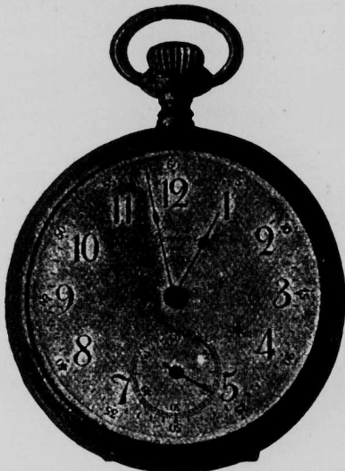
For three new subscribers. This watch is 16 size, nickel, open face, seven jewels, enameled dial, stem wind, stem set. A reliable time-keeper for man or boy.

A Canadian farm story, bound in cloth, illustrated, makes a nice Christmas or birthday gift. "Should be in the homes of all the people," says the Toronto World . For two new subscribers, or $1.25 cash.