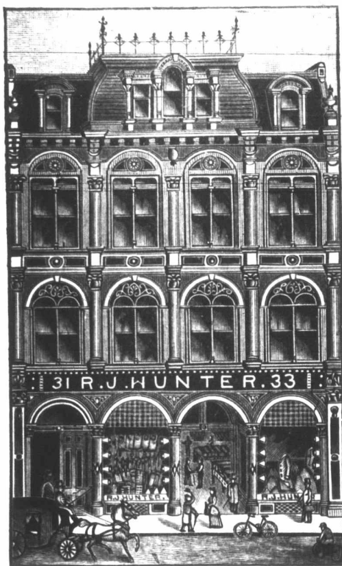
The above cut shows our new and only premises 31 and 33 King Street West.

We are now showing our New Importations of Spring Overcoatings, Suitings, etc.