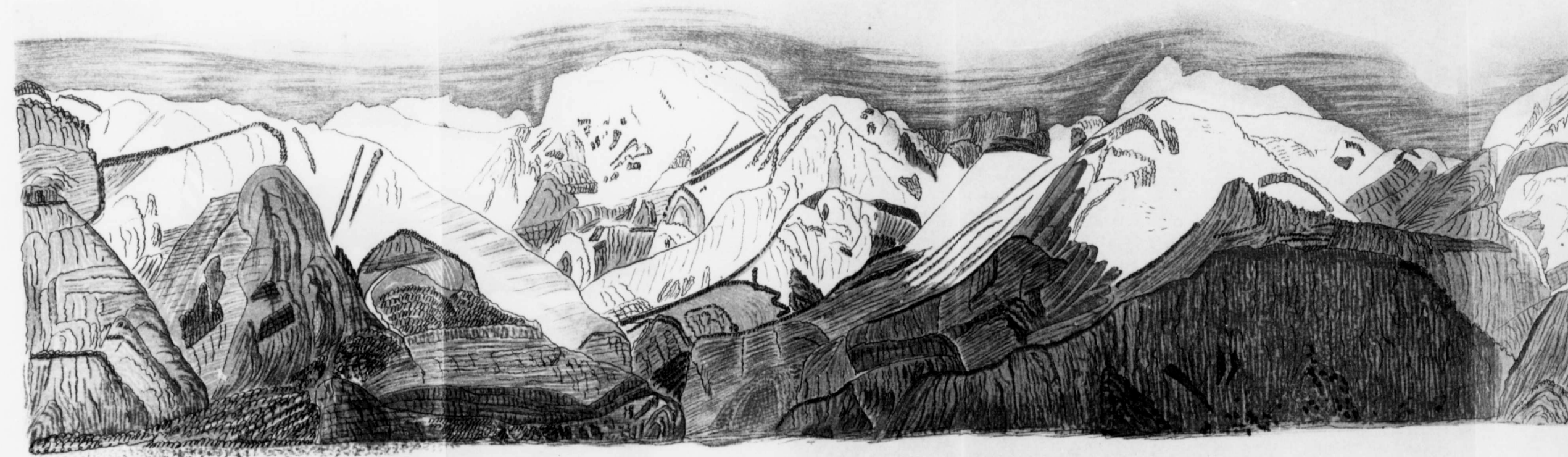
ROCKY MOUNTAINS, EAST OF THE HEAD OF THE As Sketched by David Thompson