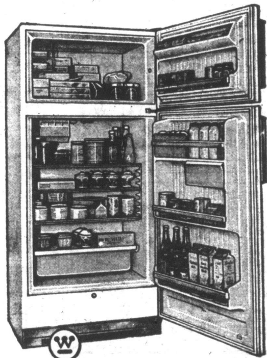
Westinghouse 13.1 cu. ft. Frost Free Refrigerator. Compact Two-door Refrigerator Model RJH30. Very accommodating. Lets you adjust the interior the way you want it: 10-position adjustable shelves, magnetic door gaskets, 124 lb. separate Frost Free freezer, full width porcelain crisper, All-purpose Egg Container. WESTINGHOUSE WHITE SALE PRICE.