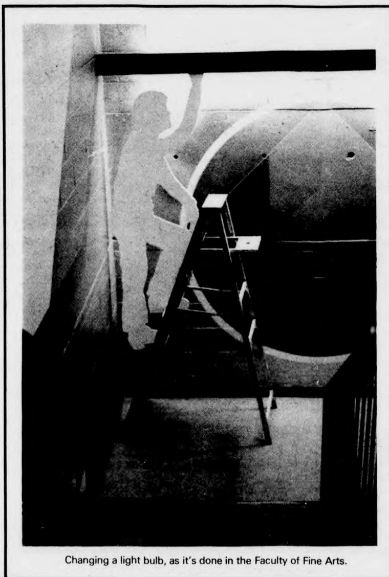
Changing a light bulb, as it's done in the Faculty of Fine Arts.

For further information contact The Centre for Continuing Education 667-2524.