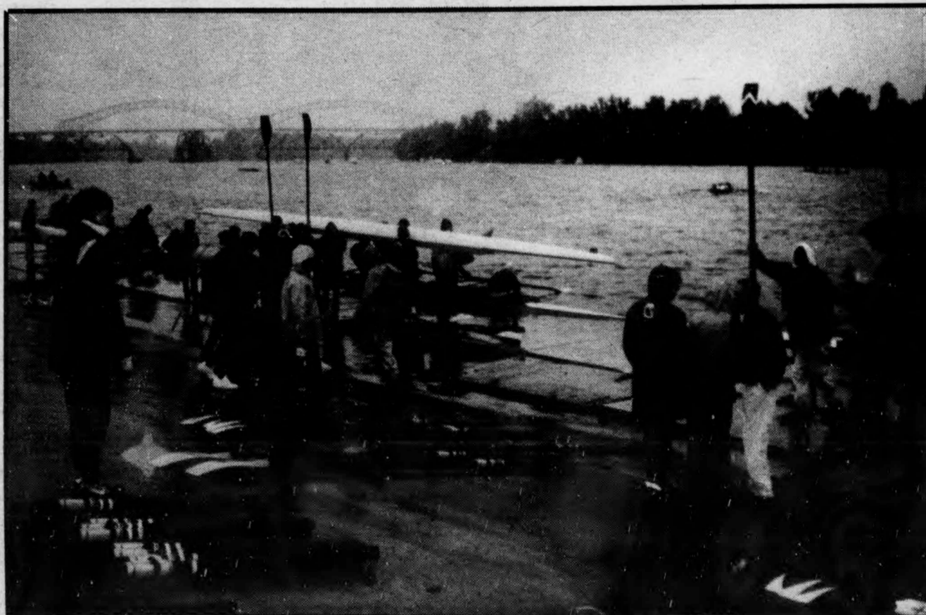
A portion of the race course. The start is several kilometres upriver