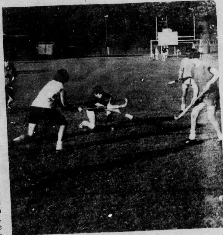
Field hockey hopefuls battling for a spot on the '69 edition of the Red Sticks, defending MIAA champions.