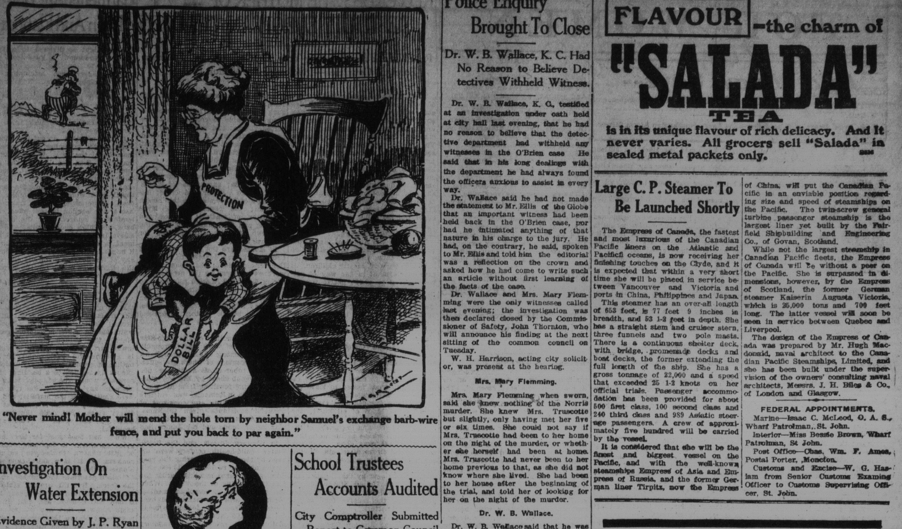
er will mend the hole torn by neighbor Samuel's exchange barb-wire fence, and put you back to par again."