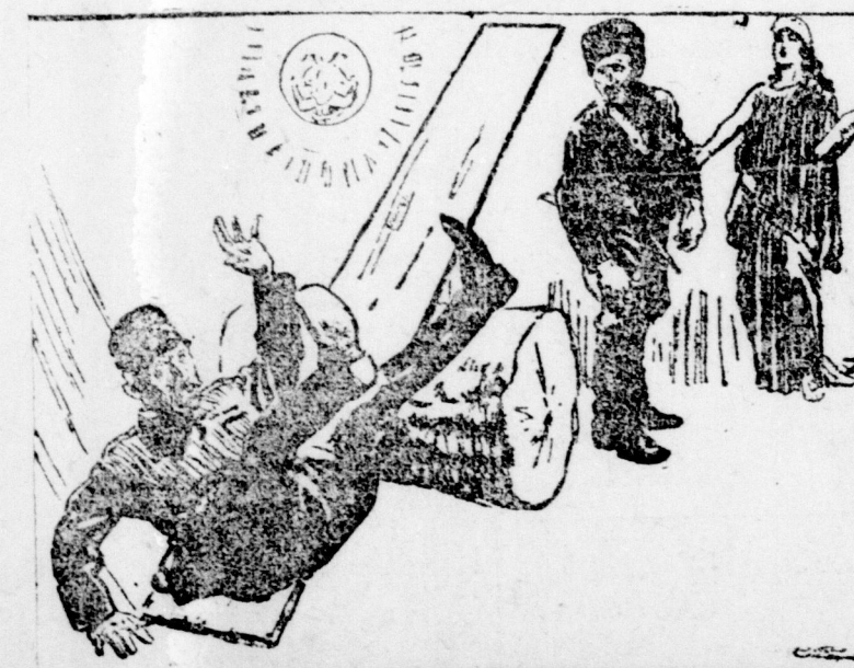
Miss Liberty (to Russia): "This isn't the way to win me. See how you have let poor Italy down!"—London Opinion.