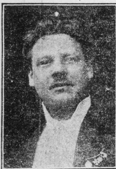
LEO SLEZAK Tenor soloist, with Toronto Symphony Orchestra on Jan. 24.