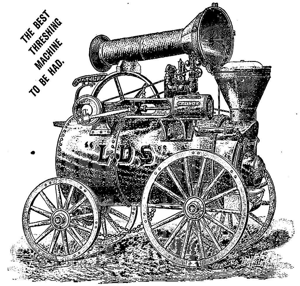
The "L. D. S." Portable and Traction Engines.

Of various Sizes and Styles, and suited to various Countries.