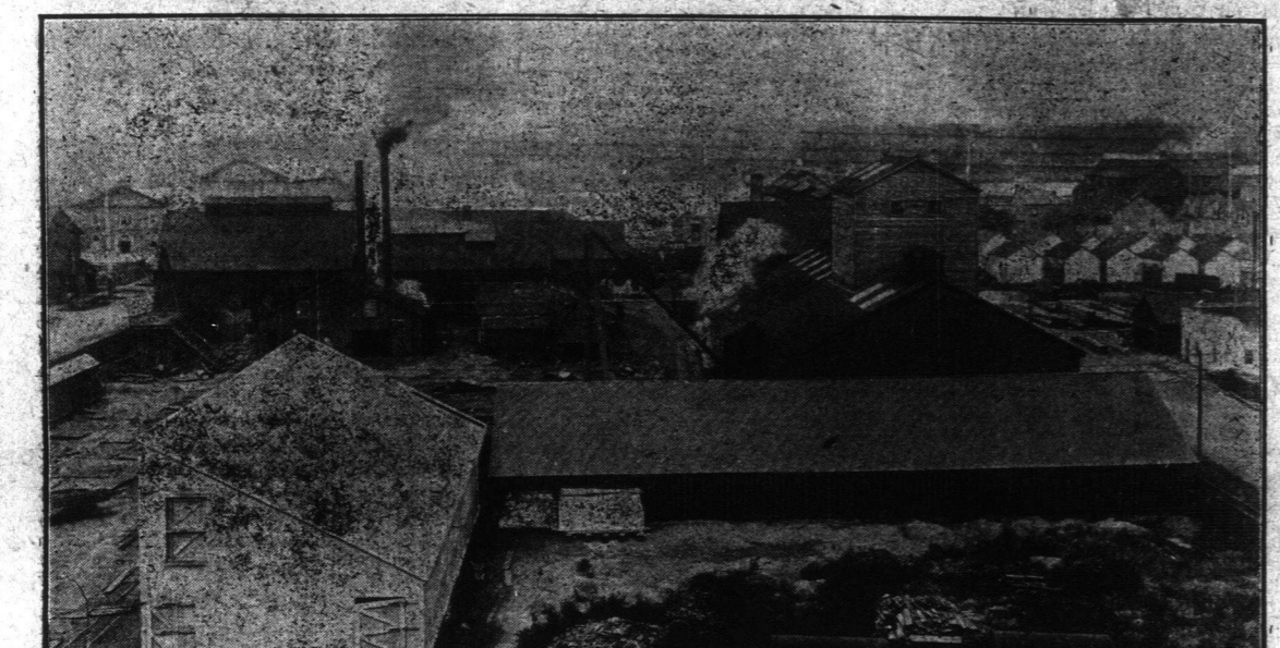
GENERAL VIEW OF ALBION IRON WORKS.