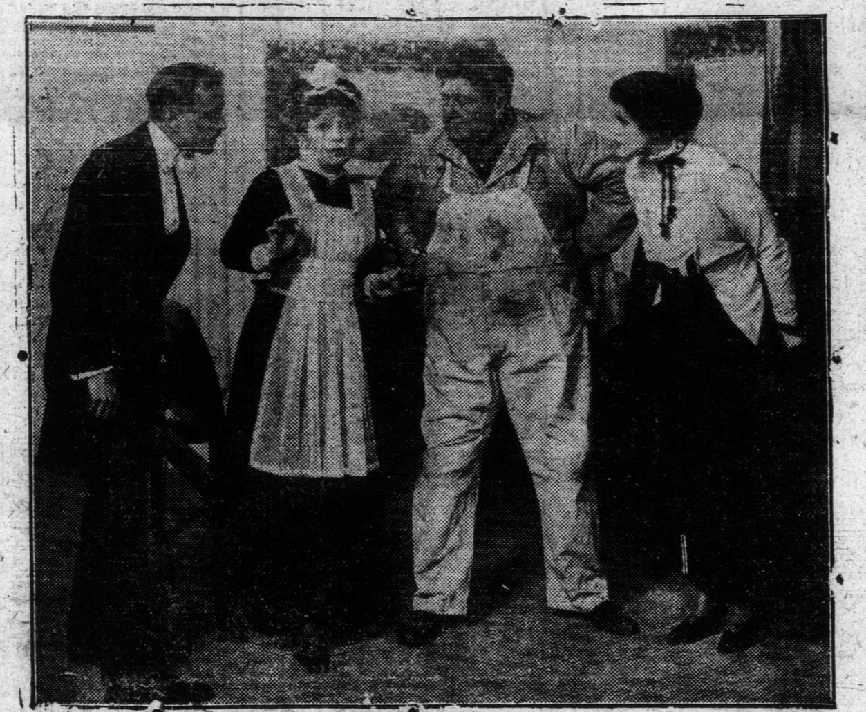
Scene from the Laugh Festival, "Fair and Warmer," at the Grand Opera House, Thursday night, Feb. 5th.