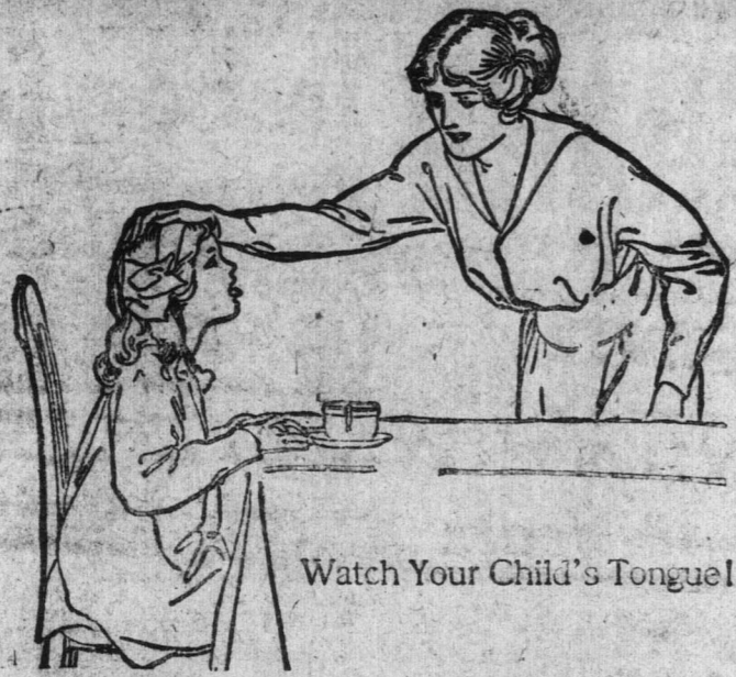
Watch Your Child's Tongue!