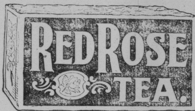
"IS GOOD TEA"

EVERY statement, every claim, every guarantee concerning Red Rose Tea from the time it was first put on the market until to-day has been lived up to to the fullest degree. Its remarkable success and enormous sale are the result of this method of doing business, coupled with the all-important fact that Red Rose Tea has always been good tea.