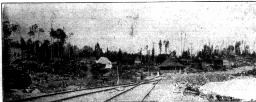
COBALT STATION, JUNE, 1905

that time attracted little or no attention, although it occurred in profusion in two or three of the weathered outcrops."