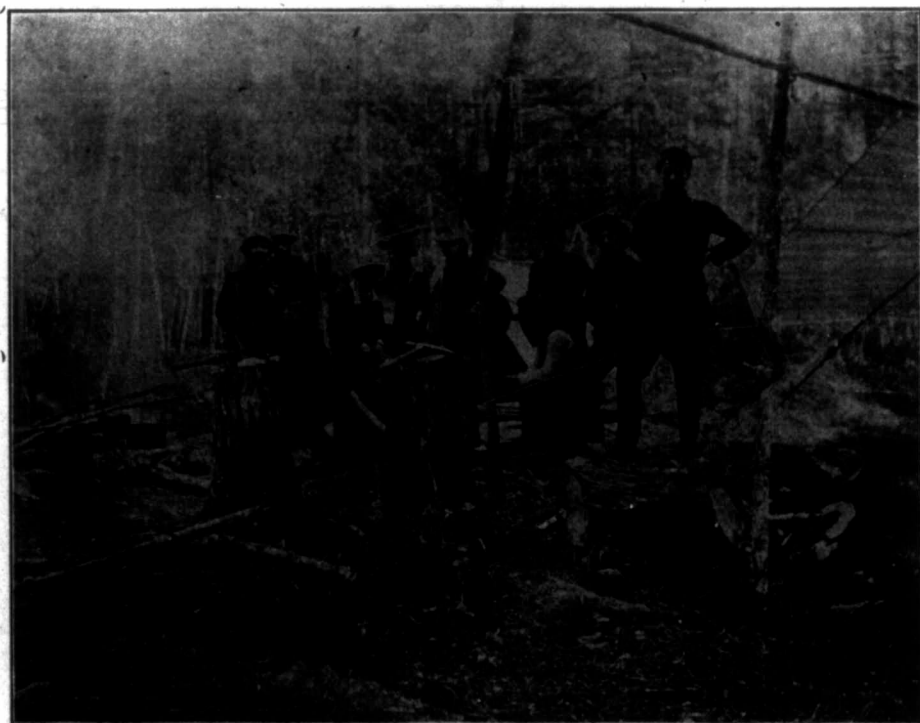
PROSPECTORS AT COBALT IN 1904.