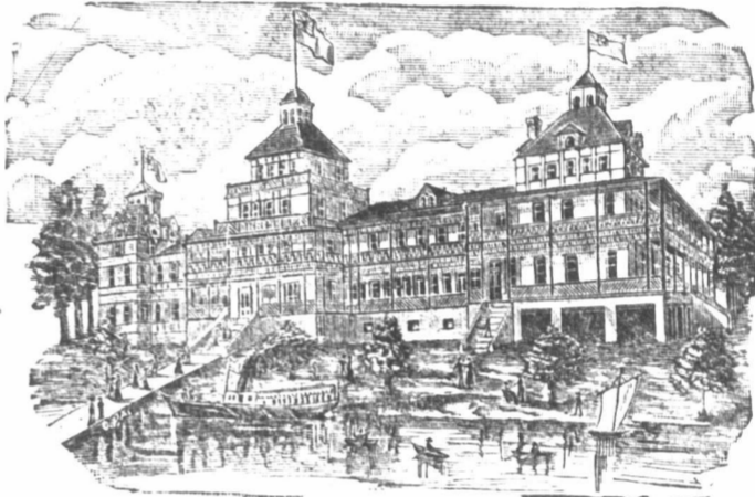
"THE PENETANGUISHENE" HOTEL.

Canada's Summer Holiday Grounds. Home of the Black Bass and Other Game Fish.