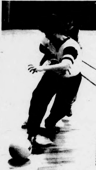
INDOOR SOCCER: Calumet and Winters players vie for ball.

On January 16, 17, 18 Laurentian University hosted the 16th Annual Intramural Hockey Championships. Once again, York University displayed its supremacy by placing four teams in the top six finishing places. Founders defeated Stong in an all York final to take the championship.