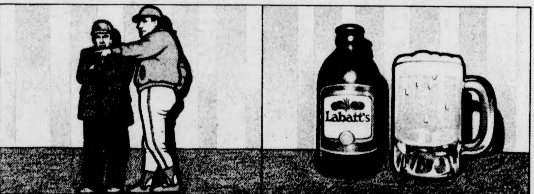
This is a disputed call.