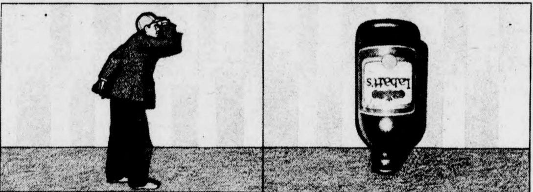
This is out of the park.