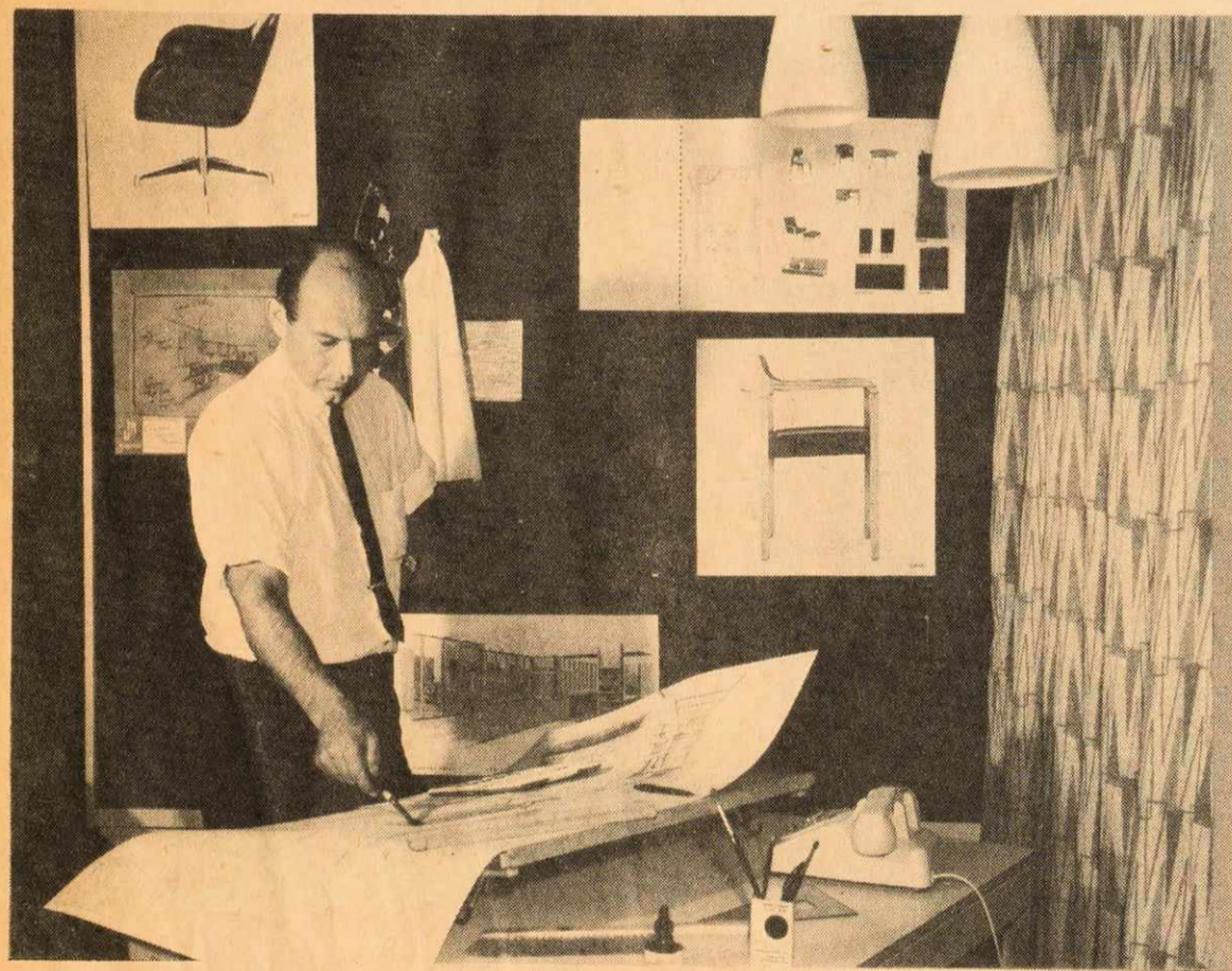
By JACK SOMMERS

"The Student Union building was created for youth, thus everything in it should be sturdy, lasting, yet still be alive. Everything must be put in for one purpose -- for the students to use and enjoy."