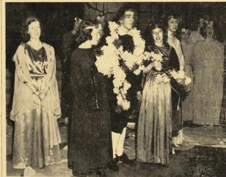
Above is one of the scenes that take place in the Glee Club's production of the Gilbert and Sullivan operetta "Patience".