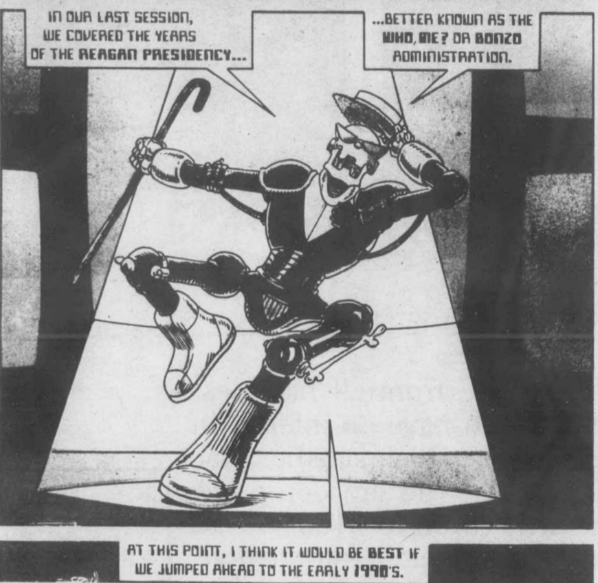
A look at what the future holds in store for us in a Tilley Hall Auditorium near you. From Gilgamesh II by Jim Starlin.