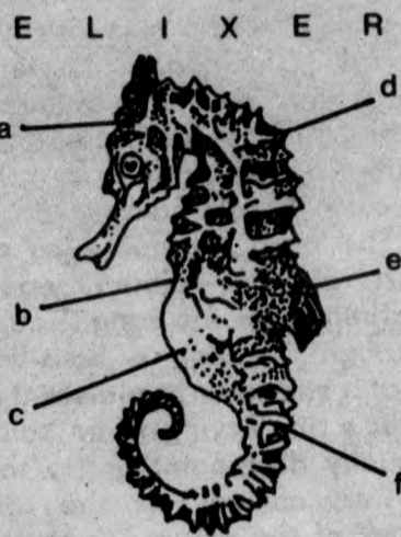
a. elixer d. 3 figures b. the citizene. quiet war c. w.t.c.c.d. f. puppet town