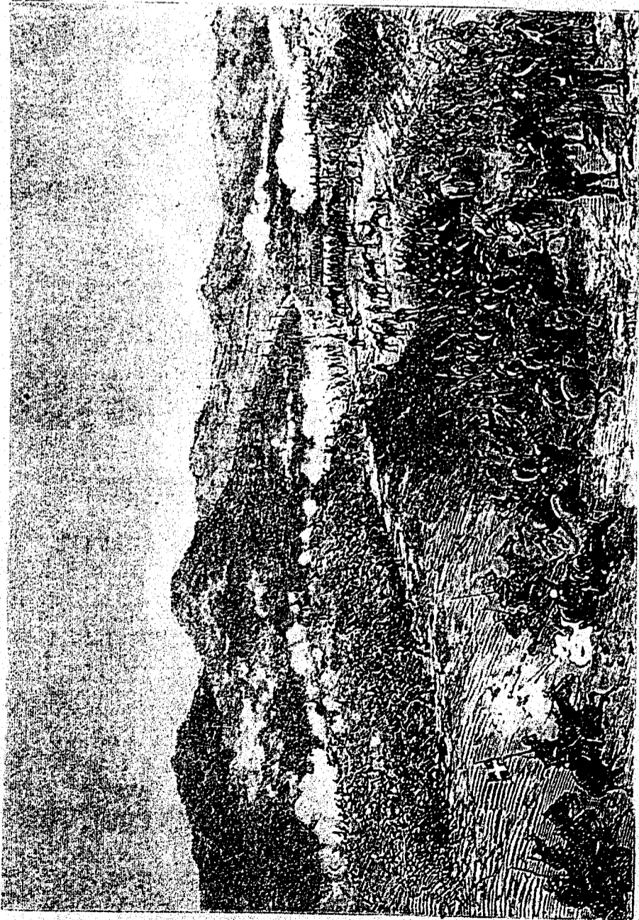
THE BATTLE OF SHIPKA, 3rd DAY.—RUSSIAN ADVANCE GUARD REPELISING THE TURKS