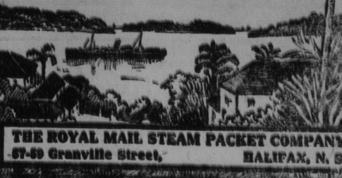
THE ROYAL MAIL STEAM PACKET COMPANY 57-59 Granville Street, HALIFAX, N. S.