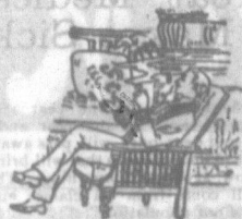
The new improved Morris Chair—self-adjustable in Oak with loose Cushions in Figured, Corduroy, Brown, Green, Blue, or Olive. $12.00.

No better Christmas Present could be chosen than a beautiful piece of Furniture.