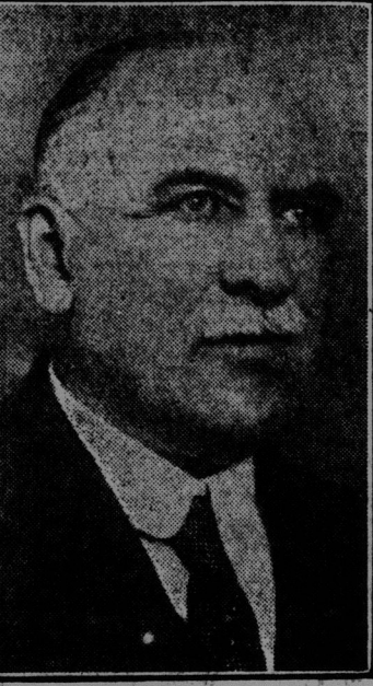
Figure In Express Co. Changes

One Horse Start. Af that time the delivery equipment consisted of one horse with wagon attached—today Halifax has fourteen horses and four large motor tucks, while St. John keeps between 10 and 12 horses and two large trucks