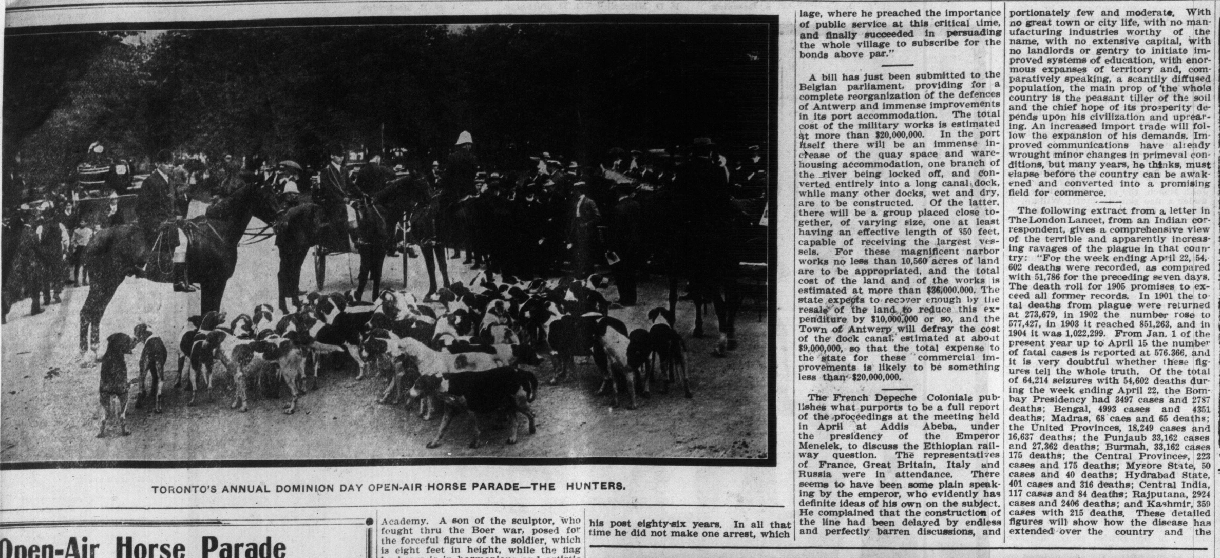
TORONTO'S ANNUAL DOMINION DAY OPEN-AIR HORSE PARADE-THE HUNTERS.