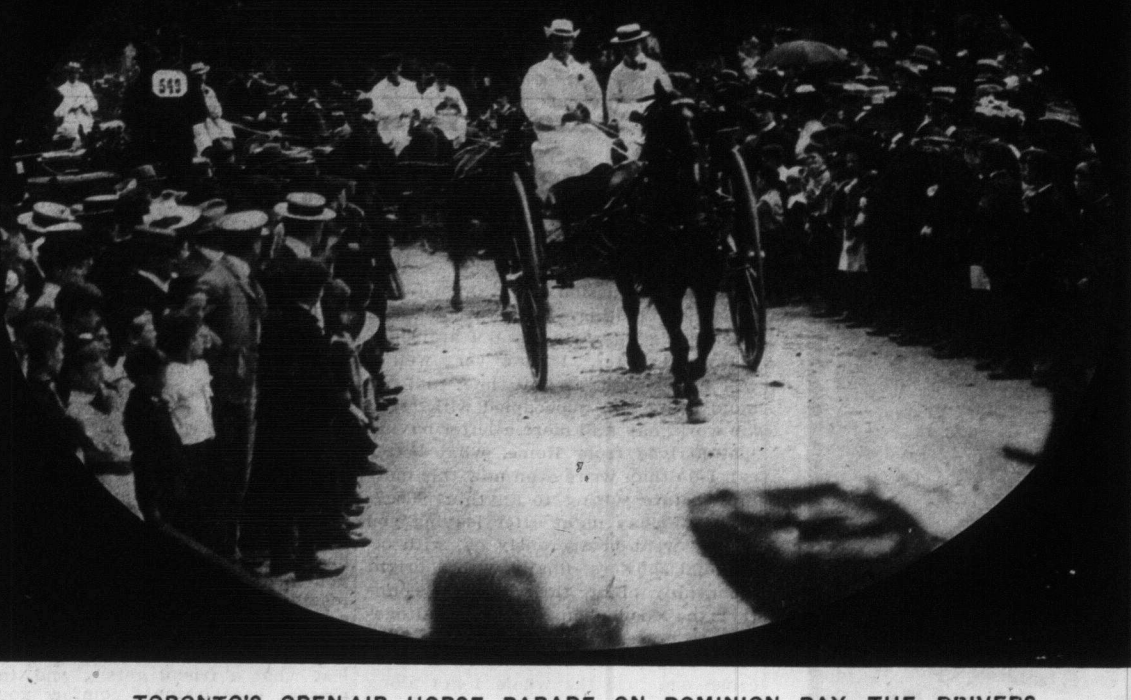
TORONTO'S OPEN-AIR HORSE PARADE ON DOMINION DAY-THE DRIVERS.