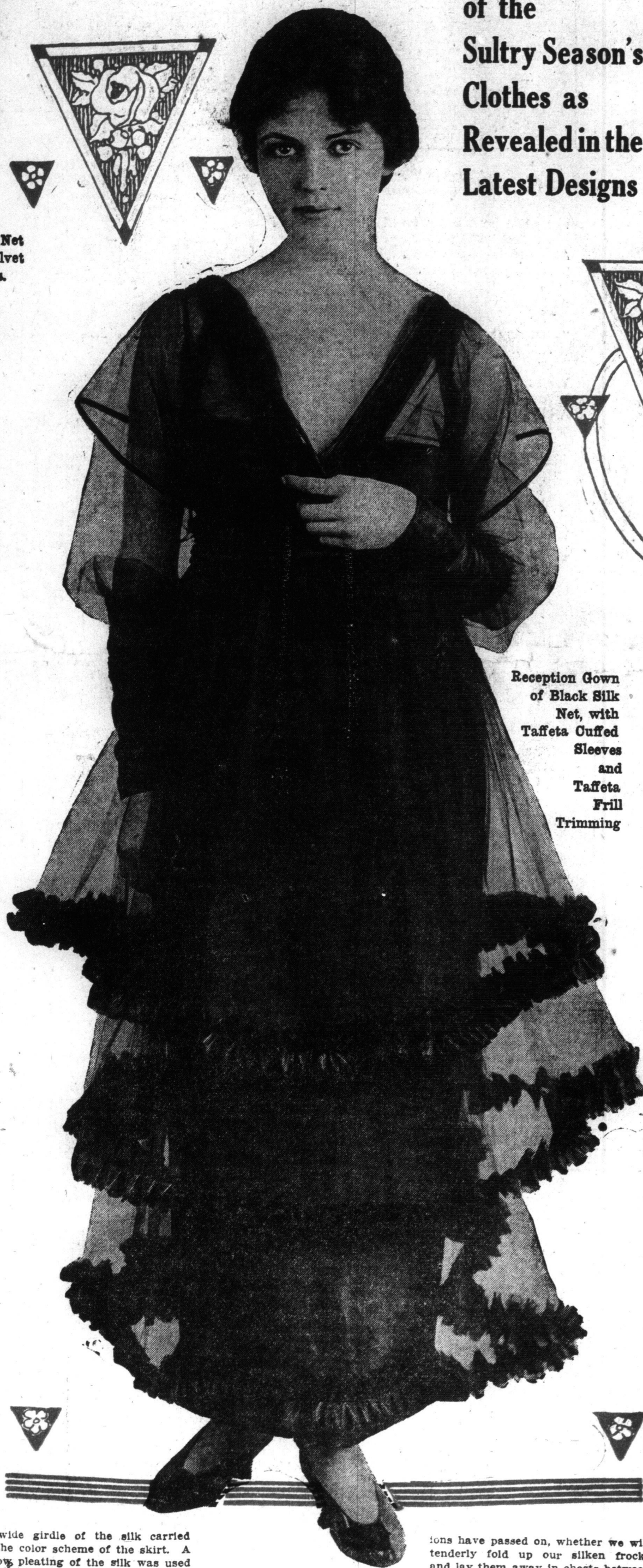
Reception Gown of Black Silk Net, with Taffeta Cuffed Sleeves and Taffeta Frill Trimming

The bodice was made almost entirely of cream-colored lace, and only