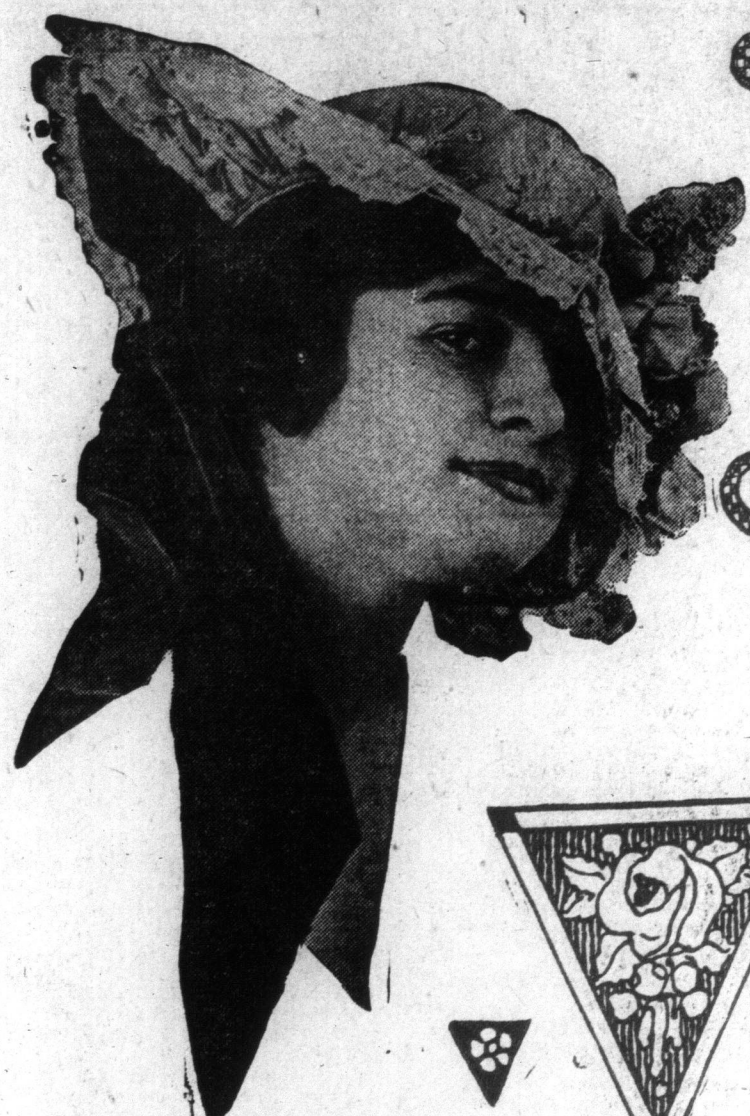
Dainty Hat Trimmed with Net Lace and Flowers, with Velvet Ribbon Bow and Streamers.