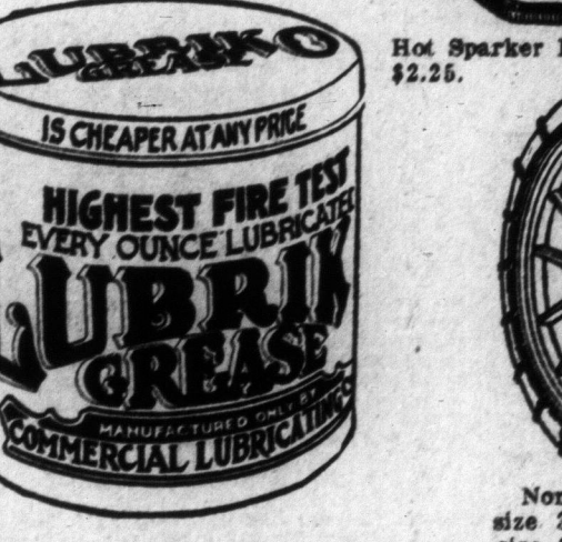
Lubriko, 5-lb. tin, $2.25; 10-lb.