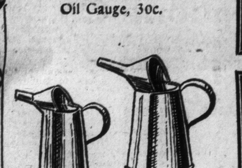
quart size, 85c; half-gallon