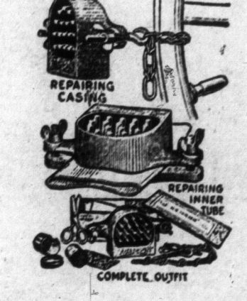
Adamson Model U Vulcanizer for Tube and Casings, $3.00.