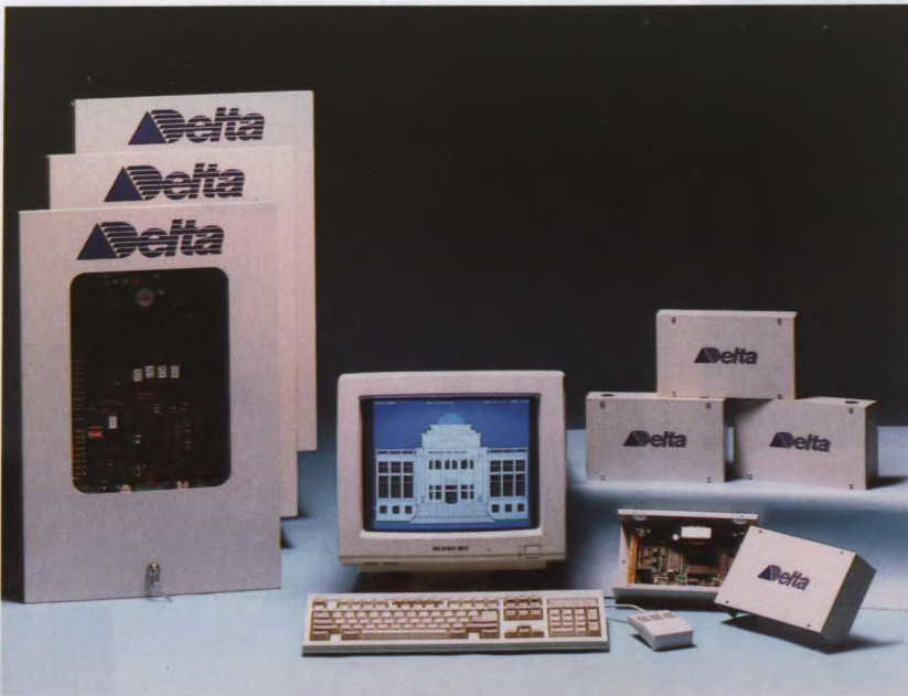
BMS, the building management system designed by Delta Controls, combines sophisticated controls with full-featured software and offers true distributed intelligence to the individual room level.

Delta Controls also provides a full line of computerized control equipment and support devices such as sensors, actuators, valves and transducers.