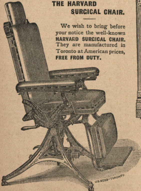
The Harvard in the upright position with head rest folded back.

We wish to bring before your notice the well-known HARVARD SURGICAL CHAIR. They are manufactured in Toronto at American prices, FREE FROM DUTY.