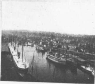
In Queen's Park, Owen Sound.