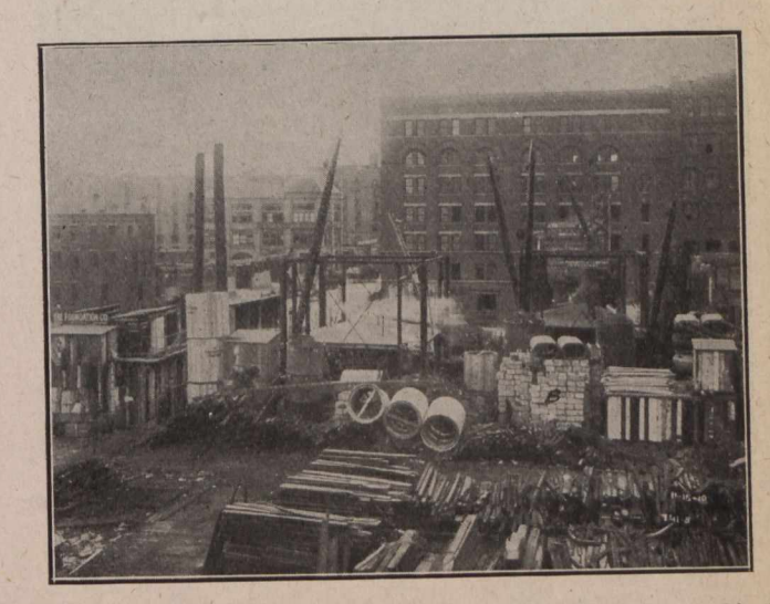
Fig. 2.—Showing Two Four-Masted Steel Derricks. Forms used for Building up Cylinders-Collapsible Steel Shafts Inside of Steel Forms. Wooden Cofferdams, Used where Concrete Stopped Below Cround. Pile of Cast Iron Blocks Marked "B" Used for Weighting Down Caissons. Each Block Weighs 11/2 to 21/4 Tons.

Under these circumstances the writer was very strongly of the opinion that the only really reliable foundation for this building would be pneumatic caissons, and the way the caissons acted while being sunk confirmed this opinion most decidedly.