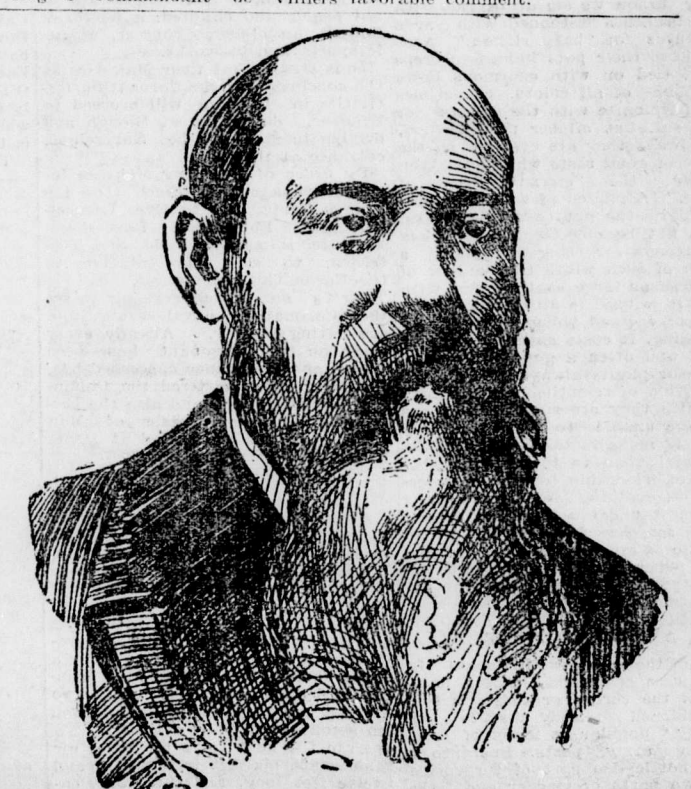
E (-PRESIDENT STEYN, In Whose Hands Rested the Termination of the Way