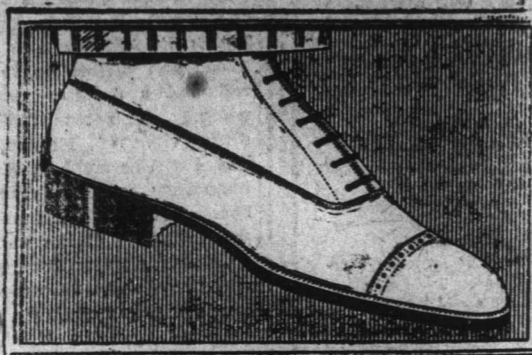
Proker—A thoroughbred, conservative model; in tan or black Cavendish calf—the handsomest, most serviceable leather we know. Or in fine black King Calf.

In Black Calf, Laced, $11.00. In Tan Calf, Laced, $10.00. In Black Vici Kid, Laced, $11.00. All New Models.