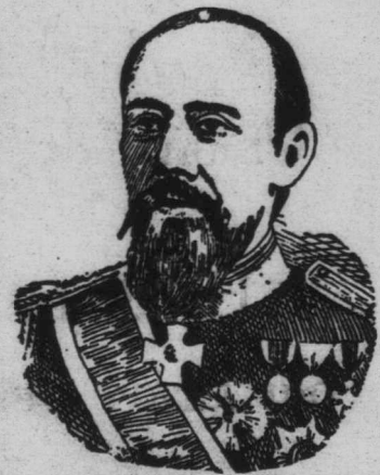
MARQUIS HIROBUMI ITO.

After the war was over he was chosen to make terms with Li Hung Chang, admittedly the most adroit statesman of the orient. It was at this stage of the game that Russia began to interfere, robbing Japan of the fruits of her victory. Ito had not forgotten the part Russia took at that time, and this thought will likely be uppermost in his attitude in China. Foreigners generally who have met him have confidence in his ability to cope with the present situation.